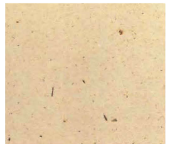
Wendy Creme **

*) Also available with undercarriage in matching foil or, if desired, anodized in Eloxal E6 EV1