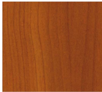
Fine Cherrywood *