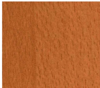
Stained beech *