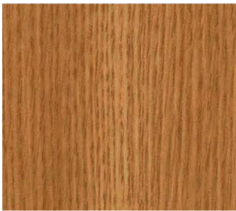
Natural Oak *