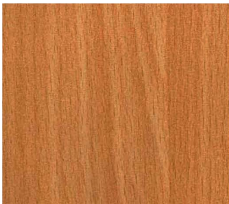
Natural beech *

All laminates are manufactured in accordance with DIN 68765 (equivalent to Emission Class E1) or DIN EN 438. If required, all surfaces are available in veneer and solid wood as an option.