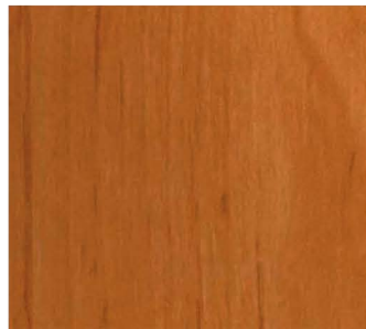
Golden Alder *