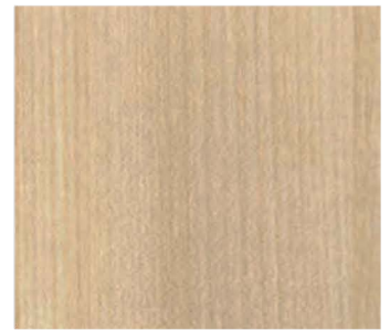
Royal Maple **

In addition to laminated wood finishes, the Völker 3080 K healthcare bed is also available in Deco-Fantasia laminate finishes.