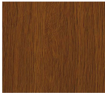
Rustic Oak *