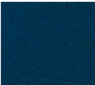
Pagami Blue **

In addition to laminated wood finishes, the Völker 3080 K healthcare bed is also available in Deco-Fantasia laminate finishes.