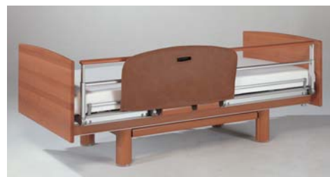
Assist Rail Spacer Cover