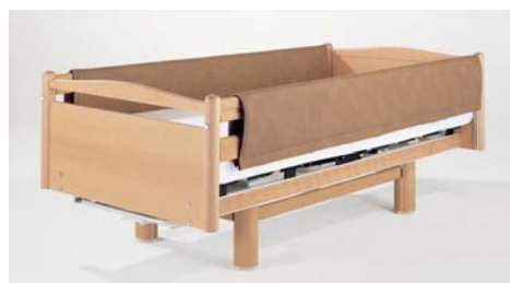
Side Rail Pads, 1 Piece