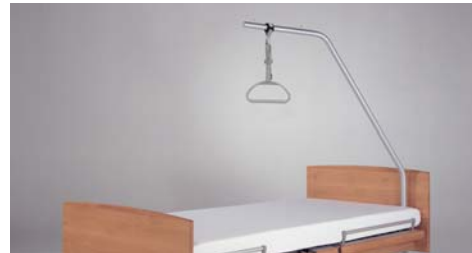
Trapeze Bar with Handle