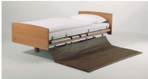
Fall Protection Mat

Accessories supplied by Volker are attached to the beds simply by dropping them into or hanging them from integrated sockets, holders or rails. All Volker accessories are designed to exactly the same high quality standards demanded from all of our beds. Therefore you can feel confident when you are using Volker approved accessories.