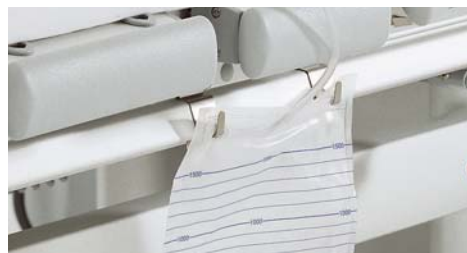
General Purpose Hook ZK-943