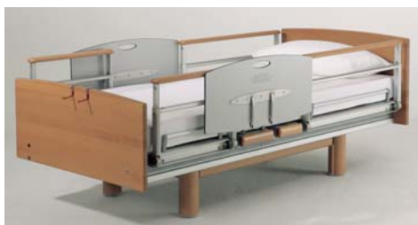
Assist Rail Spacer