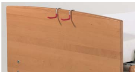
Assist Rail Spacer Holder