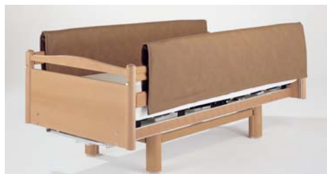
Full-length Protective Pads for Side Rails with Height Extensions