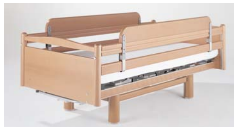
Side Rail Height Extension