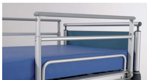
Side Rail Height Extension