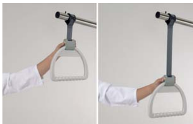
Optional: Handle with Quick Adjust