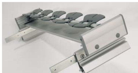
Bed Extension Piece