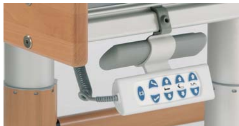
Storage Dock for Hand Control Holder

The accessories illustrated here fit current Volker healthcare beds. Accessories for older models upon request. We reserve the right to make technical alterations without further notice. When ordering please state: Model, colour, length and length of bed, width, type of lying surface and colour of wood.