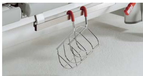
Urine Bottle Basket ZK-940/3