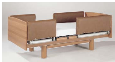
Assist Rail Pads, 2 Piece