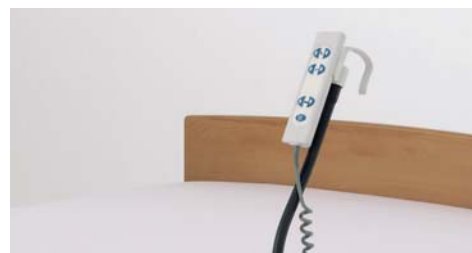
Hand Control Holder